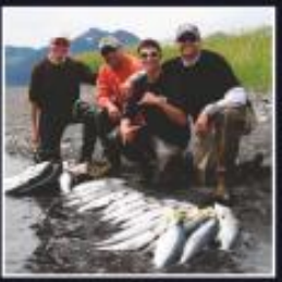
SILVER, SOCKEYE & KING SALMON

Flexible Fishing & Lodging Packages Flyout Fishing & Daily Charters Kenai River Bank Fishing Access Comfortable Lodge w/ Internet Access On-site Vacuum Packing / Freezers Wildlife & Sightseeing Tours